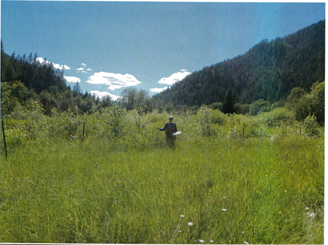
This is me in the Bull River yesterday, standing in front of one of our revegetation plots.