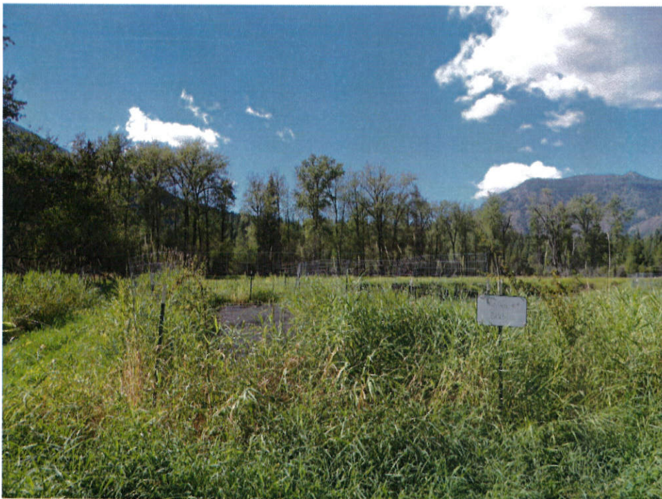
Photo 1. Rowe property revegetation effort (Photo point #1#1), August 2016.