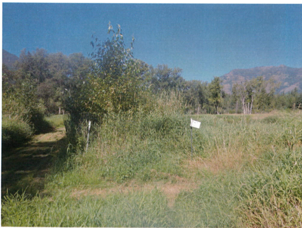
Photo 2. Rowe property revegetation effort (Photo point #1#1), August 2020.

Empowering watershed stewardship and restoration on private lands (223 grant):