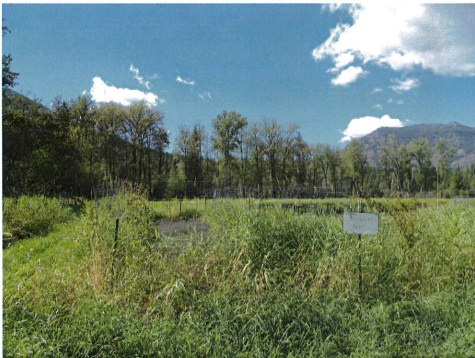
Photo 1. Rowe property revegetation effort (Photo point #1#1), August 2016.