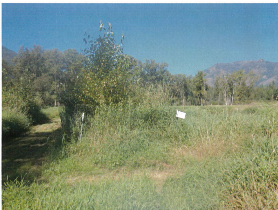
Photo 2. Rowe property revegetation effort (Photo point #1#1), August 2020.

Empowering watershed stewardship and restoration on private lands (223 grant):