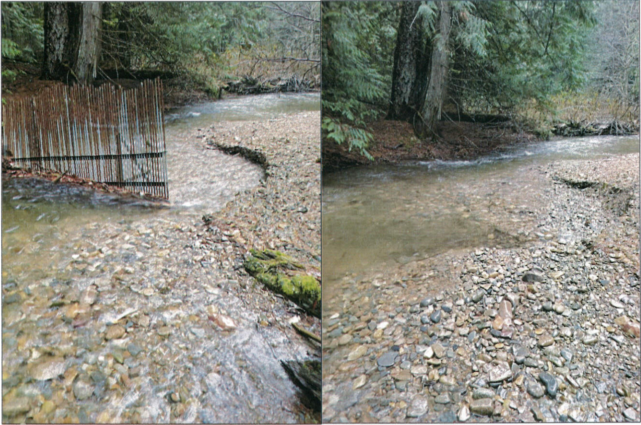
Figure 2. View looking downstream at the scour around the upstream capture weir before and after the panels were removed.