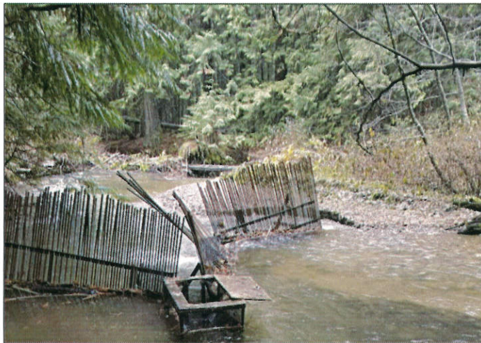
Figure 1. Upstream capture weir in the north channel of the East Fork Bull River upon arrival on November 6.