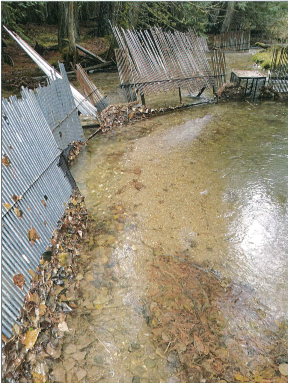
Figure 3. Looking downstream at the downstream capture weir (upstream capture weir in background) upon arrival at the site on November 6. Note the gravel aggradation in front of the panels.